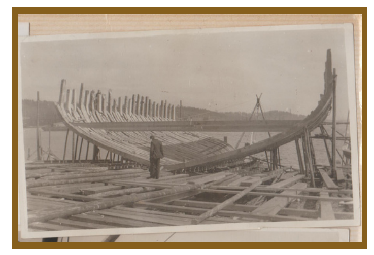
PICTURED, ABOVE: "RIBS" OF THE FERRY "GOVERNOR CORNWALLIS"

It was notable that the "Governor Cornwallis" was the first Halifax/Dartmouth Ferry to employ diesel electric engines. Unfortunately, the Ferry was only operational for about two years. On December 22, 1944, shortly after leaving the dock, the engine room crew discovered a fire in the ceiling of the engine room. The engineer and oiler managed to control the fire until the ferry had docked and unloaded. The blaze could not be extinguished, and the boat was tugged to the open water near George's Island. The remains of the ferry were left to sink into the harbour.