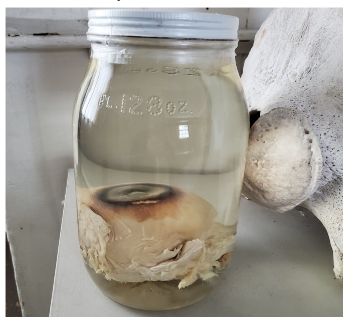
"Blinkey" the Sei whale eye at Quaker House

Lovingly nicknamed "Blinkey" by summer staff, the eye came from a Sei (pronounced 'say') whale, the third largest rorqual (baleen whales) in the world, after the blue whale and fin whale. Smaller jars are also on display in the room, containing a small octopus, krill, and the beak of a squid. It is believed that these were the stomach contents of the same whale that Blinkey came from.