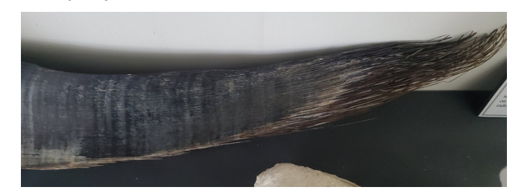
Baleen plate from a blue whale. DHM 976.044.

In just six years of operation (1785 - 1791), the Nantucket Whaling Company sold £30 000 British Pounds worth of products. That is the equivalent of just under $12,000,000 Canadian Dollars today. In fact, the Nantucket Whaling Company in Dartmouth was so lucrative that the English proposed a small change: the Quakers should leave Dartmouth and settle in Wales instead (no pun intended) to begin whaling there. This way, the extra cost and time from importing products could be further reduced. By 1791, many of the Dartmouth Quakers left for Wales, and took their knowledge and skills of whaling along with them. Although some Quaker families would still remain in the community, the Nantucket Whaling Company of Dartmouth was no more.