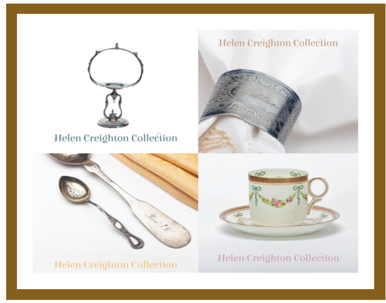
Helen Creighton Postcards, $2

A set of four postcards featuring beautifully photographed artifacts from the Dartmouth Heritage Museum's Collection that were owned by Helen Creighton. A perfect gift for any Helen Creighton enthusiast. Card dimensions: 5-1/2" x 4-1/4".