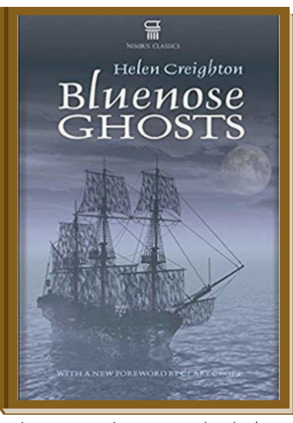
Bluenose Ghosts, 2nd ed. $15

Ghosts guarding buried treasure, phantom ships, haunted houses and supernatural omens -these are just some of the strange phenomena that you will encounter in Bluenose Ghosts. Unexplained mysteries all the more chilling because they are the experiences of ordinary people, as told to