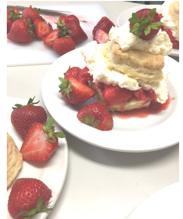
Strawberry shortcakes served at the strawberry tea. Strawberries were donated by Noggins.

Do you have an ideas for next summer? Let us know! Send your suggestions info@dartmouthmuseum.ca .