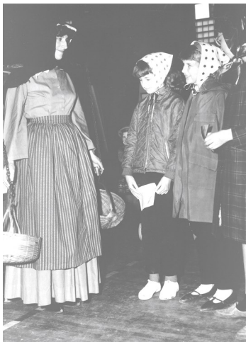
What's the best Halloween costume you've ever seen? (DHM 1974.040.001, October 1965)